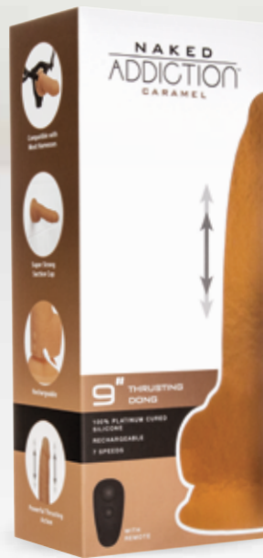
88425 9" Caramel Thrusting Dong with Remote