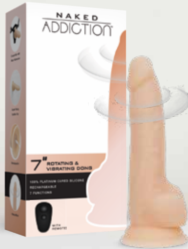
88325 - 7" Vanilla Rotating & Vibrating Dong with Remote

Overall Length: 7in (178mm) Insertable Length: 4.7in (120mm) Diameter: 1.75in (45mm)